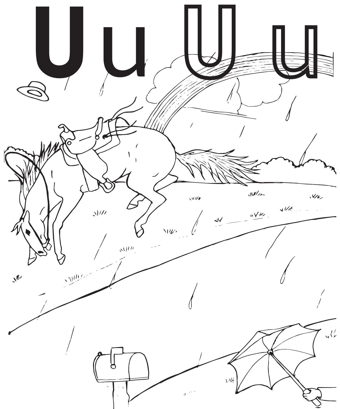
Big U, little u. U is very useful. You use it when you say, "Your umbrella's use has upset Uriah's untrained bay."